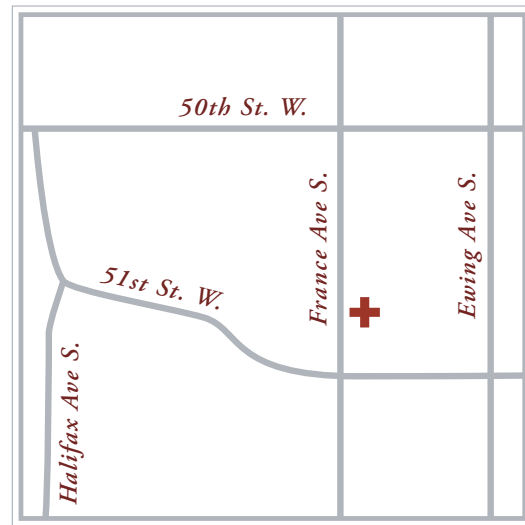
Parking available behind building and on-street

From Downtown Minneapolis. Start on I-394 W and follow for approx. 3 miles. Merge onto MN-100 S via Exit 5. Take the W 50TH ST exit toward Eden Ave. Turn Left onto W 50th St. Continue to follow 50th St W. Turn Right onto France Ave, End at 5049 France Ave S.